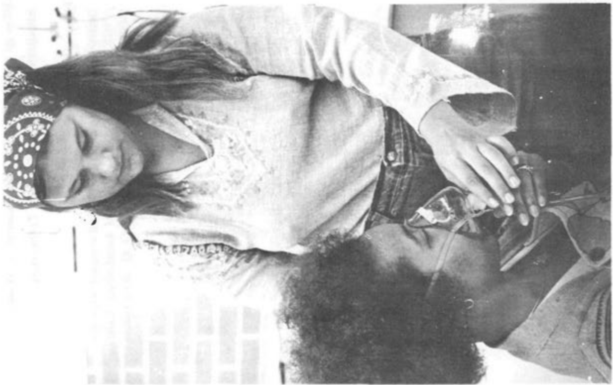
...and ... .. ... .. ... ..