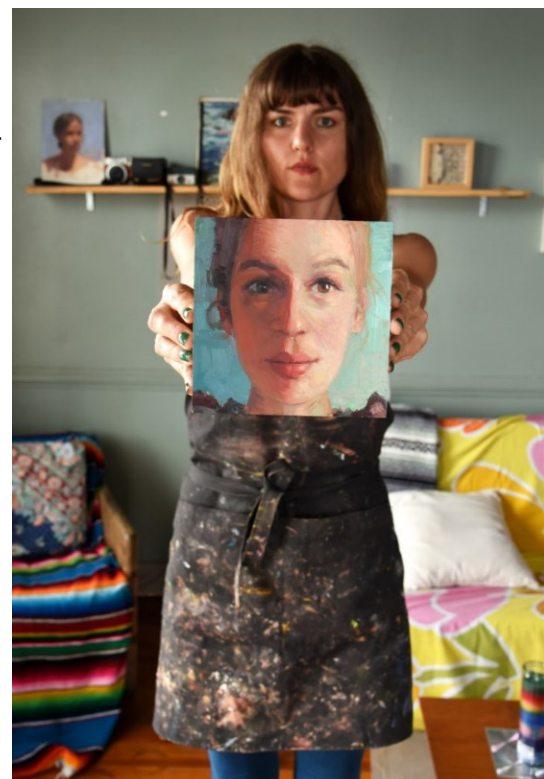
In her studio holding one of her portraits.