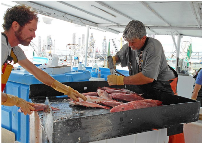
Left: Workers at Katie’s Seafood prepare red snapper for market. Located at Pier 19 in Galveston, Katie’s Seafood has supplied fresh Gulf seafood since 1998 and served as the basis for the National Geographic Channel’s series, “Big Fish Texas.” Katie’s Seafood House restaurant is scheduled to open in fall.